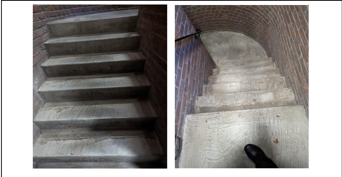
Photo No. 5 Observation - Stair treds and risers were found to be in good order.