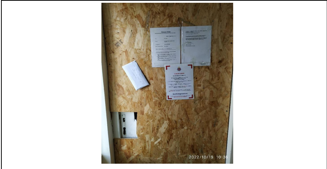
Photo No. 5 Observation-Closure order on flat 54. Door secured. Job previously raised for repair.